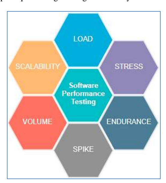
Figure 1.2 Software performance Testing

of a frameworks or software project. The requirements ought to be archived, significant, quantifiable, testable, recognizable, identified distinguished business needs with characterized to a degree of detail adequate for framework design. Software requirements incorporate business requirements, client requirements, framework requirements, outer interface prerequisite, useful requirements, and non-useful requirements. In prerequisite articulations each individual business, client, practical, and non-useful necessity would show characteristics. Attributes prerequisite explanations are finished, correct, attainable. important, prioritized, unambiguous, and undeniable. Be that as it may, it's insufficient to have superb individual necessity explanations. So requirements assortments are utilized to gather a bunch of prerequisite or gathering of necessity.